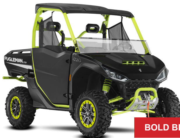
BOLD BLACK & GREEN