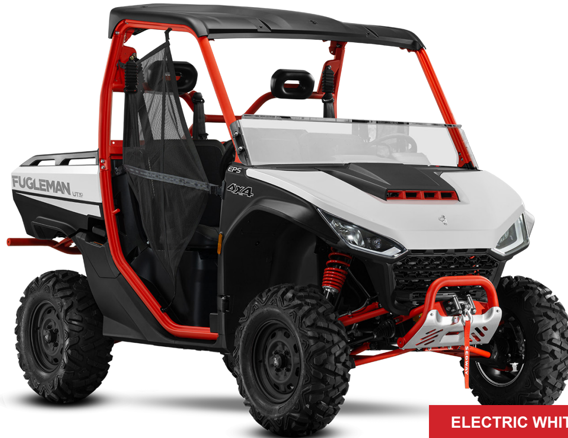
ELECTRIC WHITE & RED