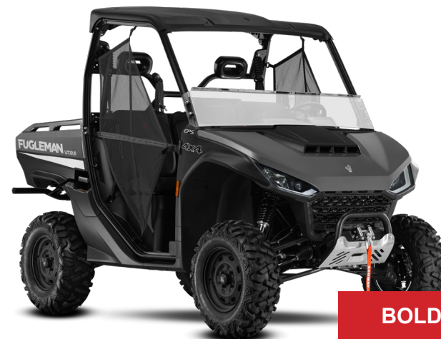
BOLD BLACK & GREY