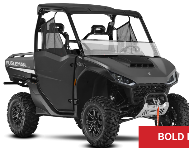
BOLD BLACK & GREY