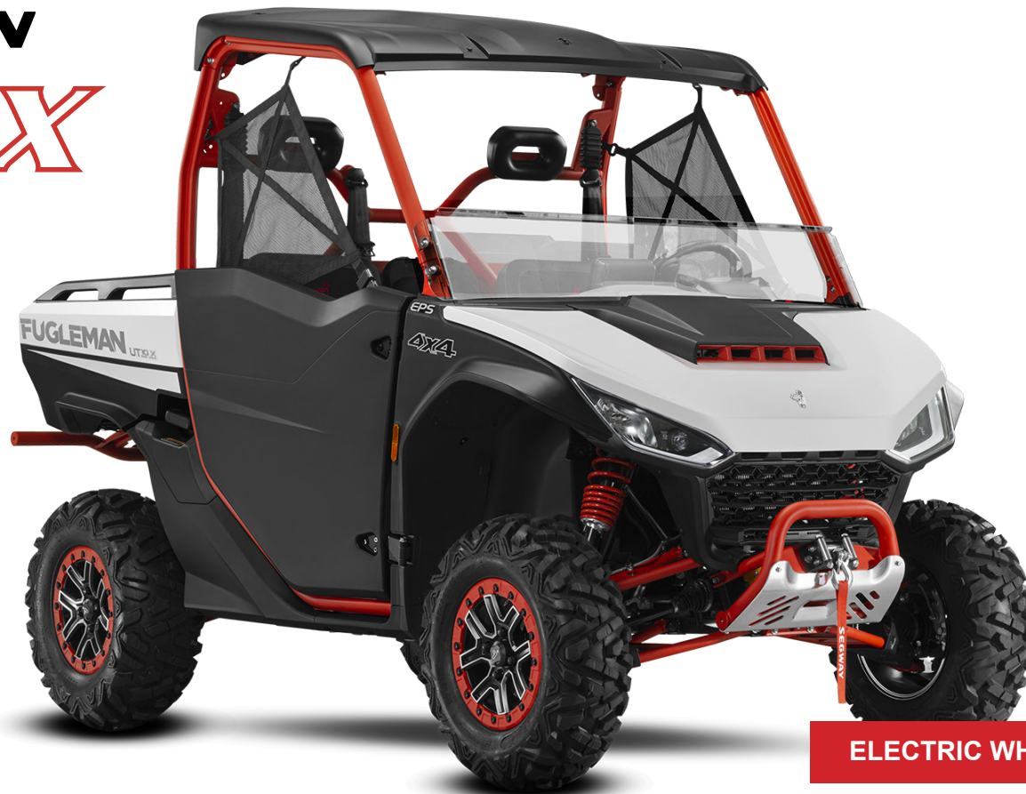
ELECTRIC WHITE & RED