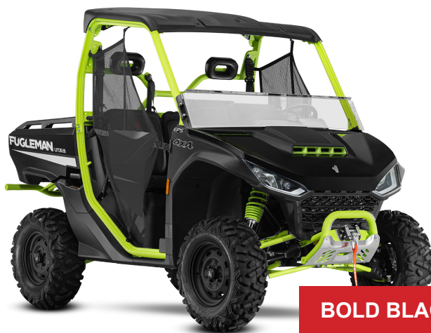
BOLD BLACK & GREEN